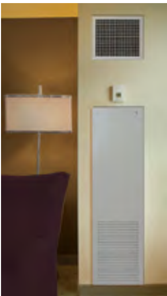
IEC or competitor's hi-rise ready for replacement.