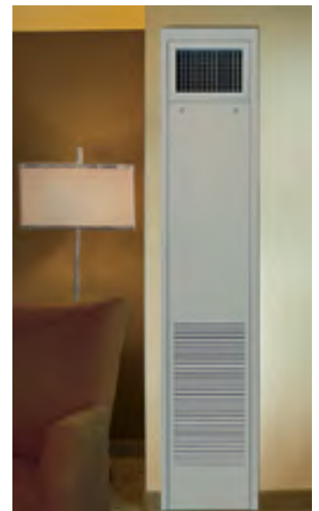
Slide MINI ReStora MOD™ into cavity, complete electrical and piping hookups, and start up.